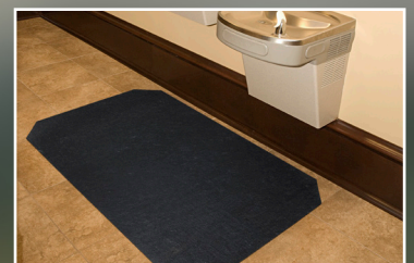
Sure Stride® (Adhesive-Back Matting)