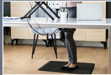
TuffComfort Standing Desk Mat

Prolonged standing puts pressure on the feet, leg muscles, spine, neck, and shoulders which can lead to chronic pain, injuries, and muscular disorders. By providing employees with anti-fatigue mats in standing areas, or even at their desks, it can increase productivity and reduce the pain associated with standing for long periods of time. Standing on an anti-fatigue mat at your desk burns calories, reduces energy consumption, alleviates stress to the back and legs, and also reduces fatigue as a whole.